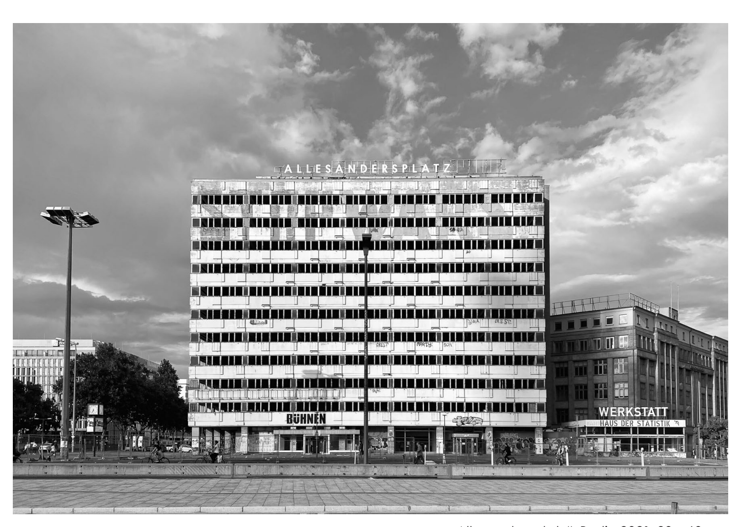
"Allesandersplatz", Berlin 2021, 90 x 60 cm

Curator of the exhibition: Nadine Barth / barthouse