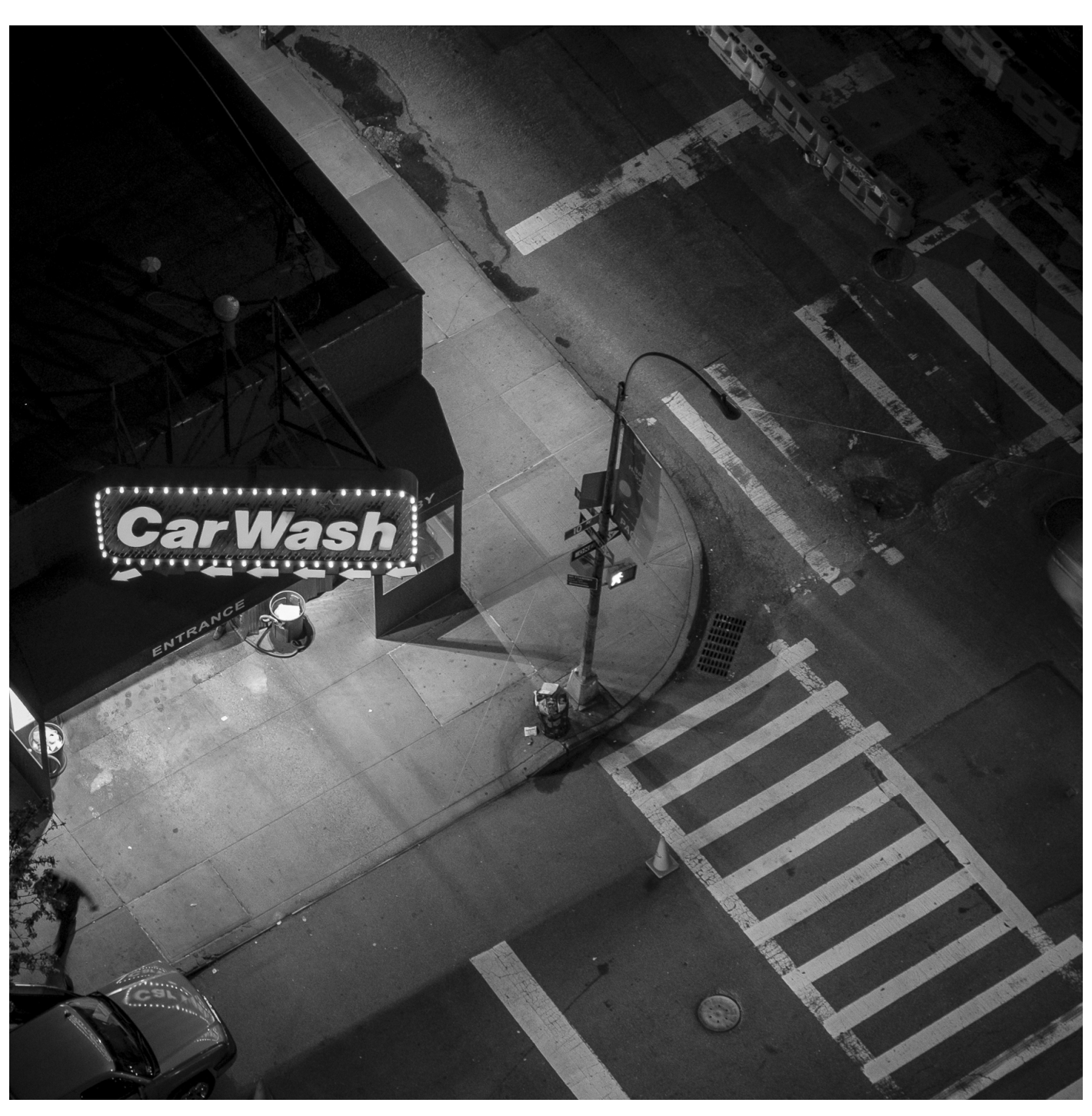
"Carwash – View from Ralph's Rooftop", New York City 2019, 30 x 30 cm