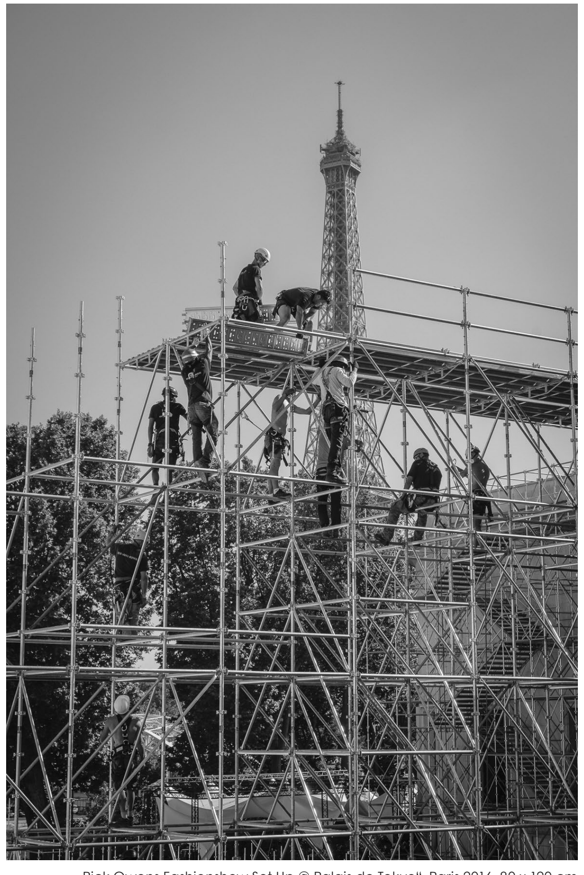
"Rick Owens Fashionshow Set Up @ Palais de Tokyo", Paris 2016, 80 x 120 cm

CITY MOMENTS – Memories of a time when travelling was a breeze